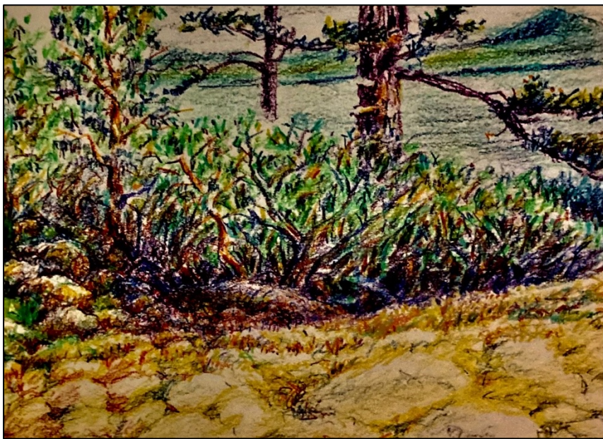
Turkey Vulture nesting and roosting site, high up at the very end of Elderberry Lane, offered as a way to better understand our island's location in the Salish Sea. – by Ronaldo Norden