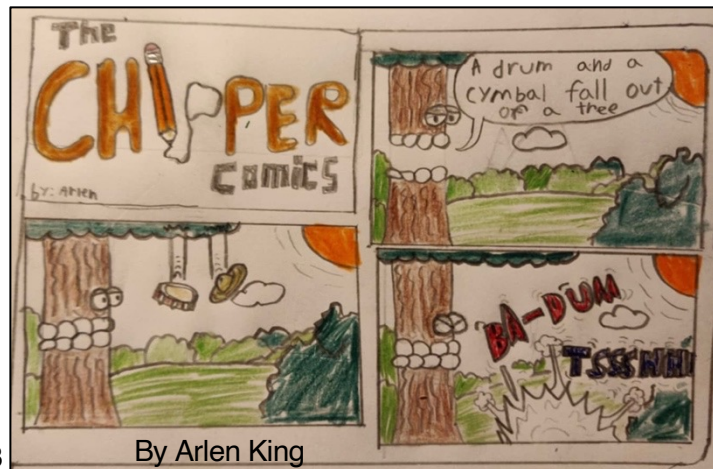
By Arlen King