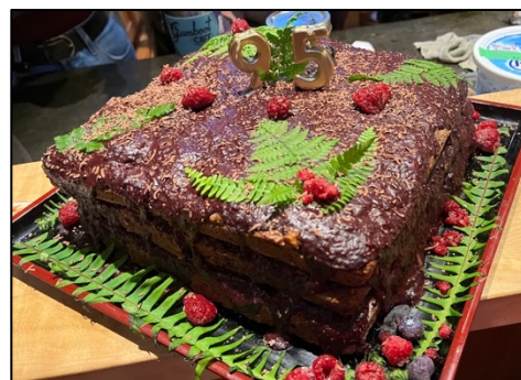
GF applesauce chocolate cake for Grandpa's (Ken's Dad's) 95 th birthday celebration in May. – Dana Lepofsky

Remove cakes from the pans after cooled. Generously spread raspberry-chocolate sauce over middle layer and let it drizzle over the sides. Place second layer and put remaining berry sauce over the top and sides. Put a few whole berries on the top to decorate.