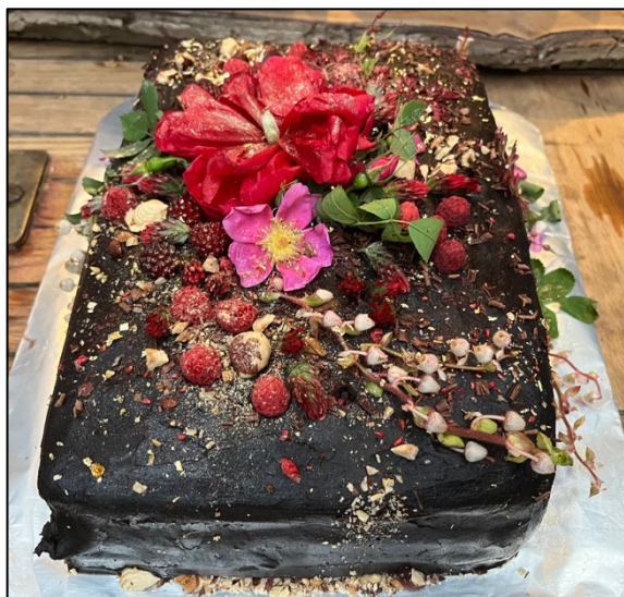
Jen's GF sponge cake with Ermine icing and custard filling for Mark B.'s birthday celebration in May.

Beat your butter for a few minutes until it is pale and smooth. Add the roux one tablespoon at a time while beating at a medium speed. Then add the salt and the vanilla and any other flavours you want. Continue beating until it holds its shape. It is now ready to use. – Jennifer Brant