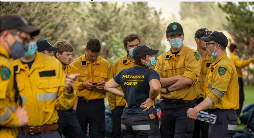
Firefighting crews from New Brunswick arrive in Kamloops. More than 3,000 firefighters and support staff are on the fire lines, including crews from Alberta, New Brunswick and Quebec—with more on the way.