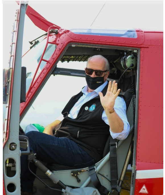
BC Premier John Horgan boards a helicopter at the PWCC.