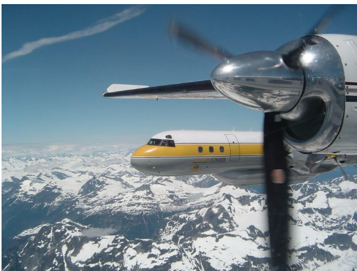
Turbo Commander 1000 is the best bird dog aircraft, according to Air Attack Officer, Jeff Austin.

As an officer he works with a pilot, flying side by side in a bird dog, a small but powerful airplane, to assess proposed airtanker runs and assess airtanker drops for accuracy.