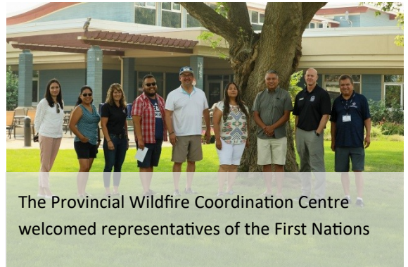
The Provincial Wildfire Coordination Centre welcomed representatives of the First Nations