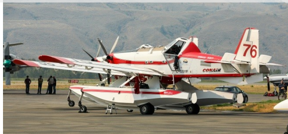
Water-skimmer aircraft—Air Tractor AT-802F—provide critical prepare to support crews on the ground.