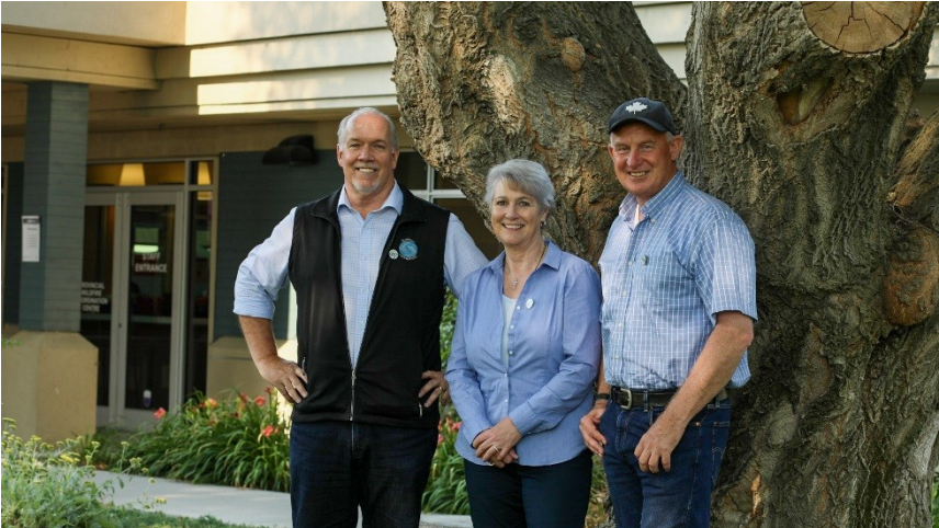
BC Premier John Horgan and Ministers Katrine Conroy and Mike Farnworth travelled to the Provincial Wildfire Coordination Centre.

Over 350 fires burned in Kamloops Fire Centre, over 1,100 across BC in 2021 so far