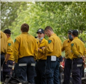
Firefighters from New Brunswick