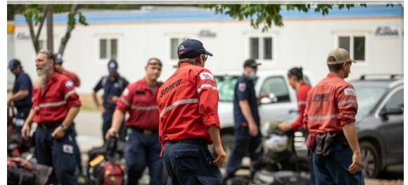
La Société de protection des forêts contre le feu (SOPFEU) arrived from Quebec to support